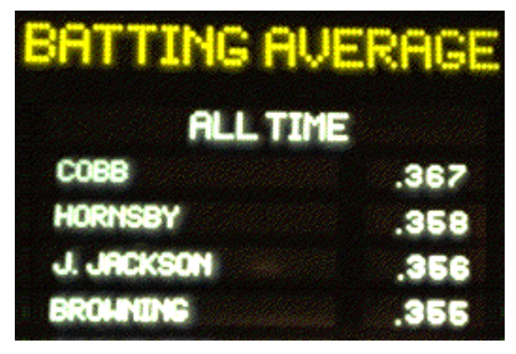
Display in the Hall listing the Highest Carrer Batting Averages

player that he was. Surely the Hall must have read there own file. Finally, I come to the conclusion that the Hall did not base their decision on Jackson's achievements and greatness on the field, as they should have, but to scandalous lies and the blind sweeping hand of one man's "justice."